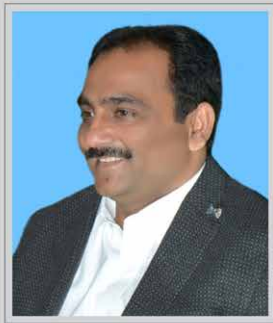
Muhammad Naeem Akhtar Khan Bhabha Minister for Agriculture / Pro-Chancellor