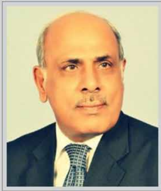
Muhammad Rafique Rajwana Governor of the Punjab/Chancellor